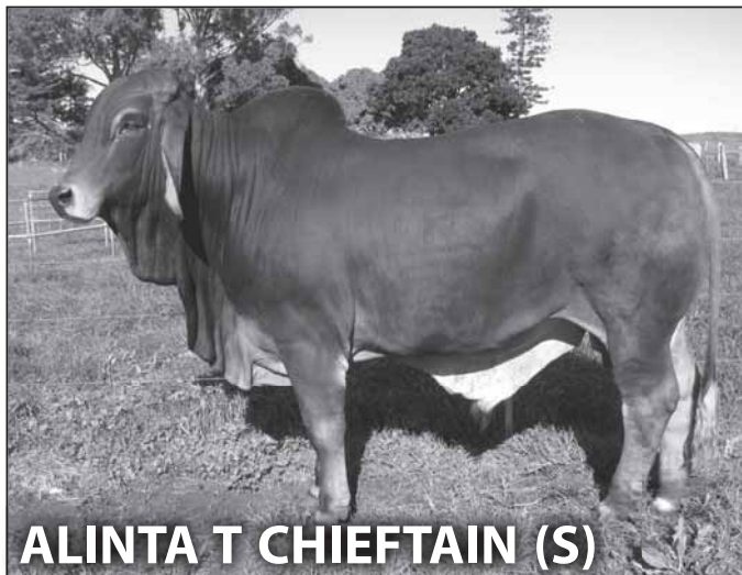
ALINTA T CHIEFTAIN (S)