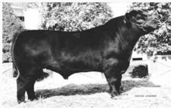
Trowbridge MIDLAND C69.