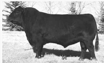
HF TIGER 5T.